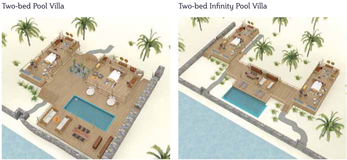
Two-bed Pool Villa

Interconnected Three-bed and/or Four-bed Pool Villa